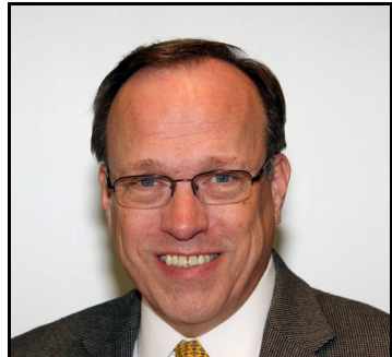
Commissioner Mark Munroe