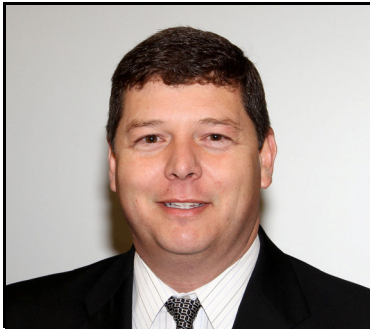
Commissioner Todd Book